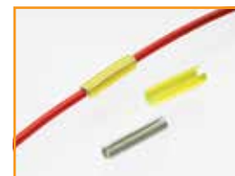
D-150-C-14 (Part No. CX2098-000) NSN 5970-01-611-8586